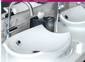
Chrome plated faucet